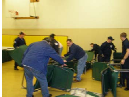
MSEC Trailer system. EMS Strike Team sets up the MSEC system during Symposium 2009 at West Middlesex Middle School.

The EMMCO West region is also one of eight regions across the Commonwealth to receive a 50 bed mobile hospital system. The system consists of 6 inflatable tents and supplies necessary to establish a mobile hospital for several days. The hospitals are complimented by a heating, air conditioning, and electric supply system.