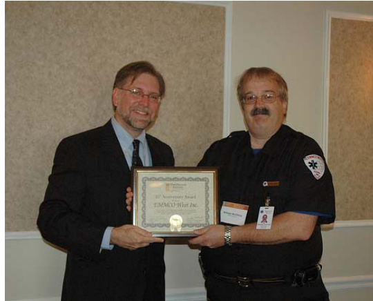
25th Anniversary Award From Manufacture's Association of NW PA

EMMCO West, Inc. was incorporated in 1983. Its primary mission is to coordinate the prehospital care system within seven Northwestern Pennsylvania counties. The area served includes Clarion, Crawford, Erie, Forest, Mercer, Venango, and Warren counties.