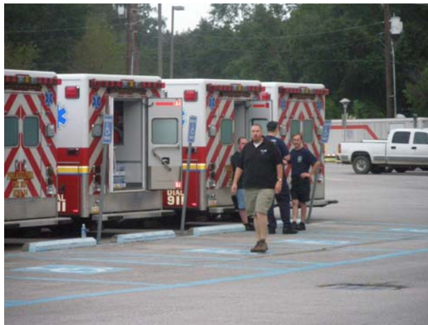
Part of the PA EMS Strike Team Ambulances that were deployed to Hurricanes Gustov and Ike