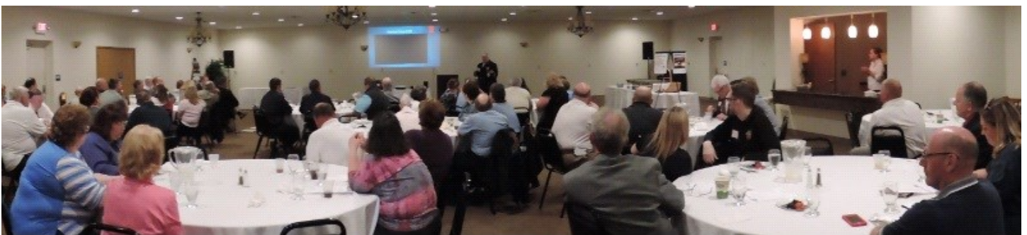
Maybe you were there??? EMMCO West's 2015 EMS Awards & Appreciation Dinner

EMMCO West is continuing to work with regional EMS agencies and county Public Safety Answering Point (PSAP) centers to ensure there are adequate EMS assets to respond to requests for 911 service.